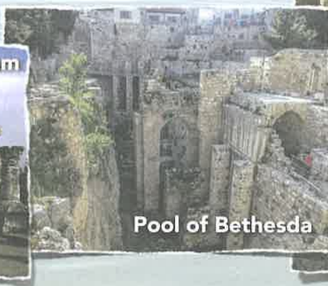
Pool of Bethesda